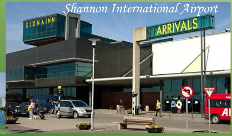
Shannon International Airport