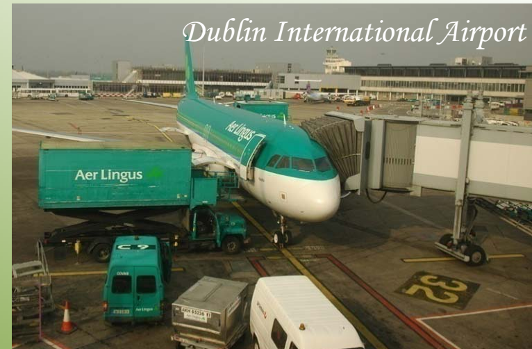
Dublin International Airport